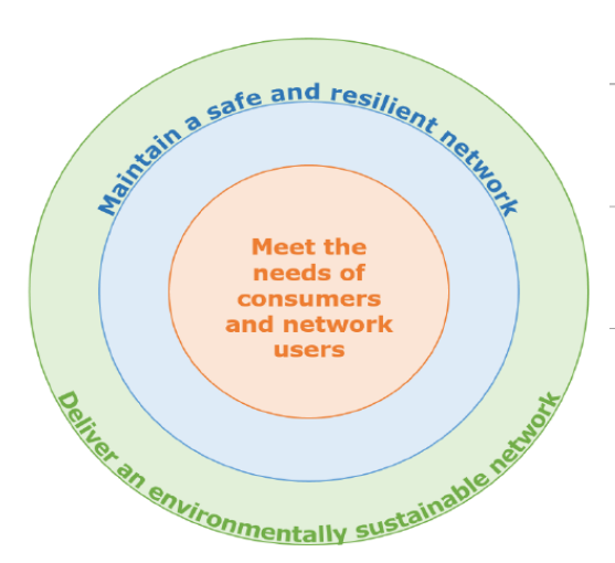
Figure 1: Output categories in RIIO-2

Network companies must deliver a high quality and reliable service to all network users and consumers, including those in vulnerable situations