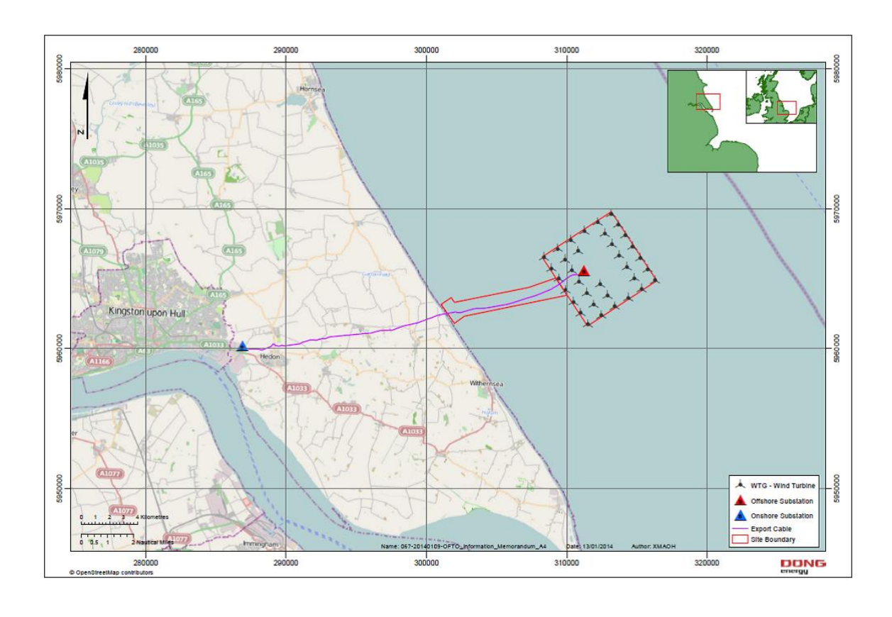
Figure 1 – Location of the WMR Wind Farm and Transmission Assets

2.1. The WMR Wind Farm is located in the North Sea, approximately 8.0km off the coast of Yorkshire, as shown in Figure 1 below. The WMR Wind Farm consists of 35 6MW wind turbine generators, with a maximum output of 205MW at the OFTO point of connection to the onshore system<sup>3</sup>.