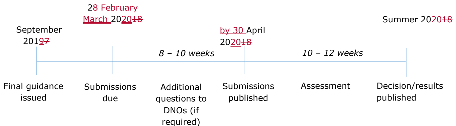
Figure 2: Indicative timetable for Tranche two tranche three of the LDR

5.10. The assessment process and allocation of the reward pot between DNO groups may change for tranches two and tranche three. A DNO's performance in a prior tranche will not affect how we assess subsequent submissions.