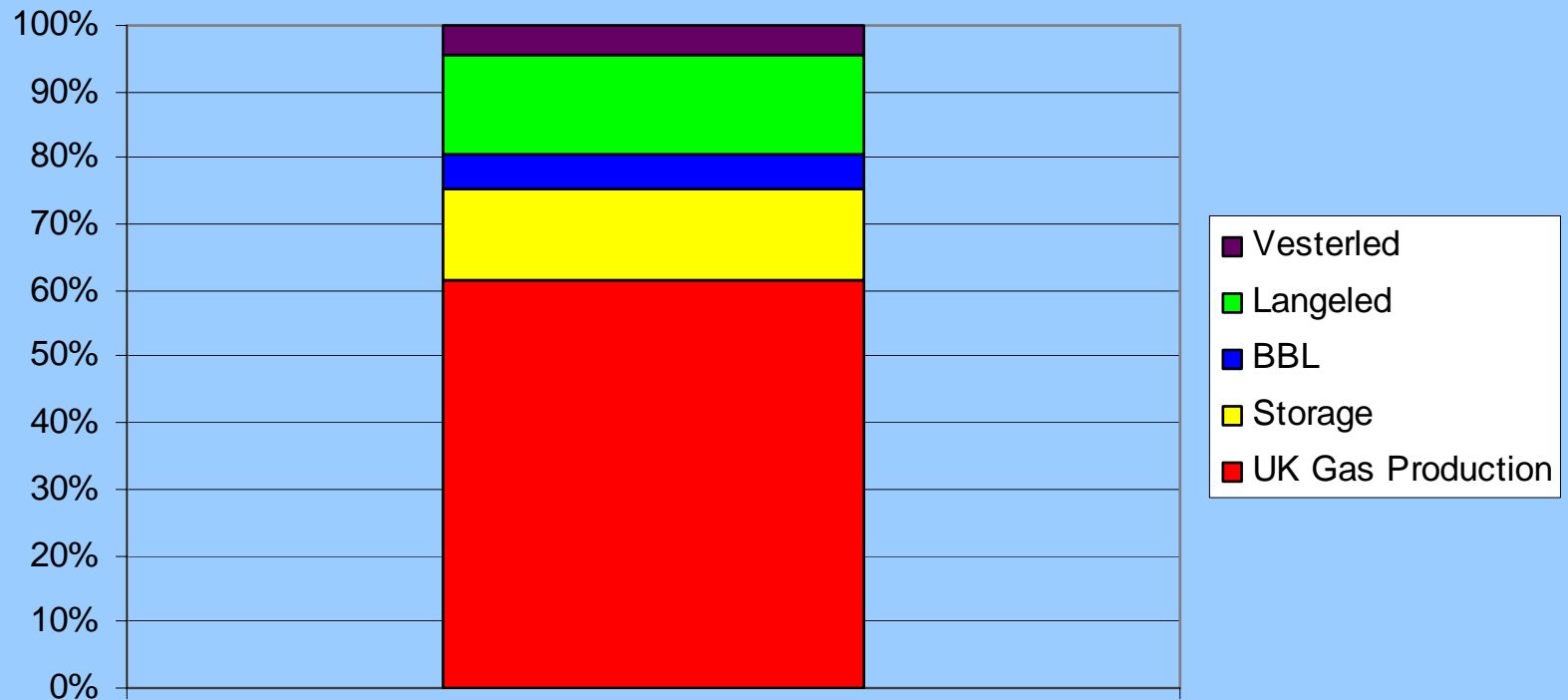
Production by source 28th September