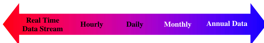
Figure 3.1 Dimensions of information: period of aggregation

3.27 3.26 When considering the extent to which information is considered by relevant parties to be commercially sensitive the Authority will seek to consider the relevant information with respect to the three following dimensions of data granularity that it considers are particularly relevant. In addition to the three dimensions illustrated in Figure 3.1 to Figure 3.3, the Authority will also seek to consider the extent to which price information is to be released under the proposal.