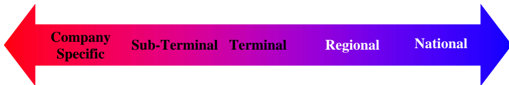
Figure 3.2 Dimensions of information: zone of aggregation

3.28 3.27 Figure 3.1 describes the time period over which the data intended for release to the market has been aggregated. For example, at one extreme the period of time over which the information that is being released has been aggregated will be close to zero, resembling a real time data stream. At the other extreme the data will have been aggregated over longer time periods, such as annual gas consumption for Great Britain.