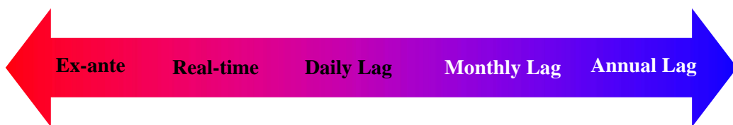
Figure 3.3 Dimensions of information: time lag

3.31 3.29 Figure 3.3 describes the time lag associated with the release of the relevant data. At one extreme the data could be ex-ante, in the sense that it provides details of planned industry or company infrastructure investment. At the other extreme the data may be released with a lag of one year or more after the event it describes has occurred. For example, this may be UKCS production data released with a one year lag.