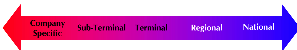
Figure 3.2 Dimensions of information: zone of aggregation