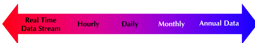
Figure 3.1 Dimensions of information: period of aggregation