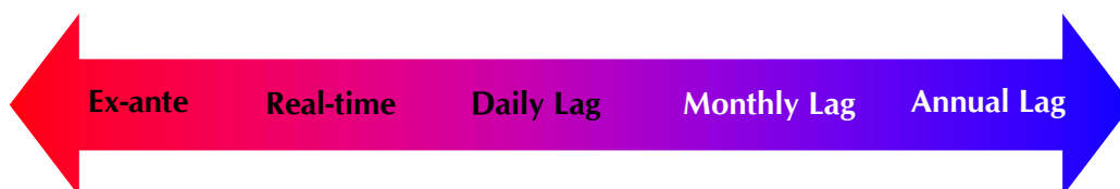
Figure 3.3 Dimensions of information: time lag

3.29 Figure 3.3 describes the time lag associated with the release of the relevant data. At one extreme the data could be ex-ante, in the sense that it provides details of planned industry or company infrastructure investment. At the other extreme the data may be released with a lag of one year or more after the event it describes has occurred. For example, this may be UKCS production data released with a one year lag.