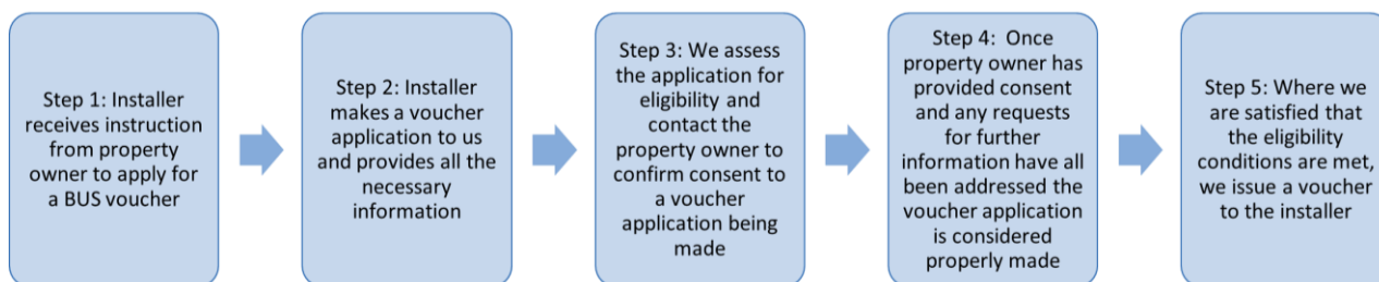
Figure 2 – Stage 1, voucher application process

5.7. The first stage of the BUS application process is the voucher application. Installers can create and submit voucher applications online via the digital BUS portal. 96