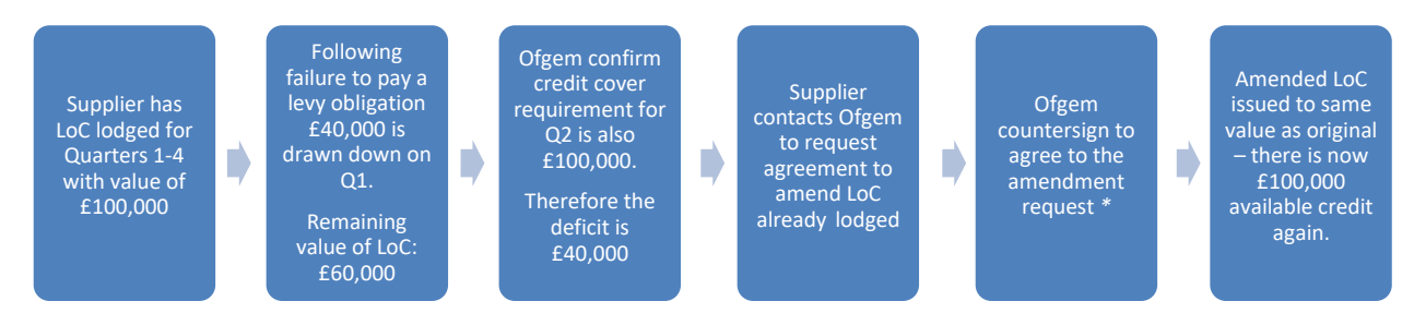
Figure 1: Illustrative example of how an amended letter of credit (LoC) will supersede the previous LoC