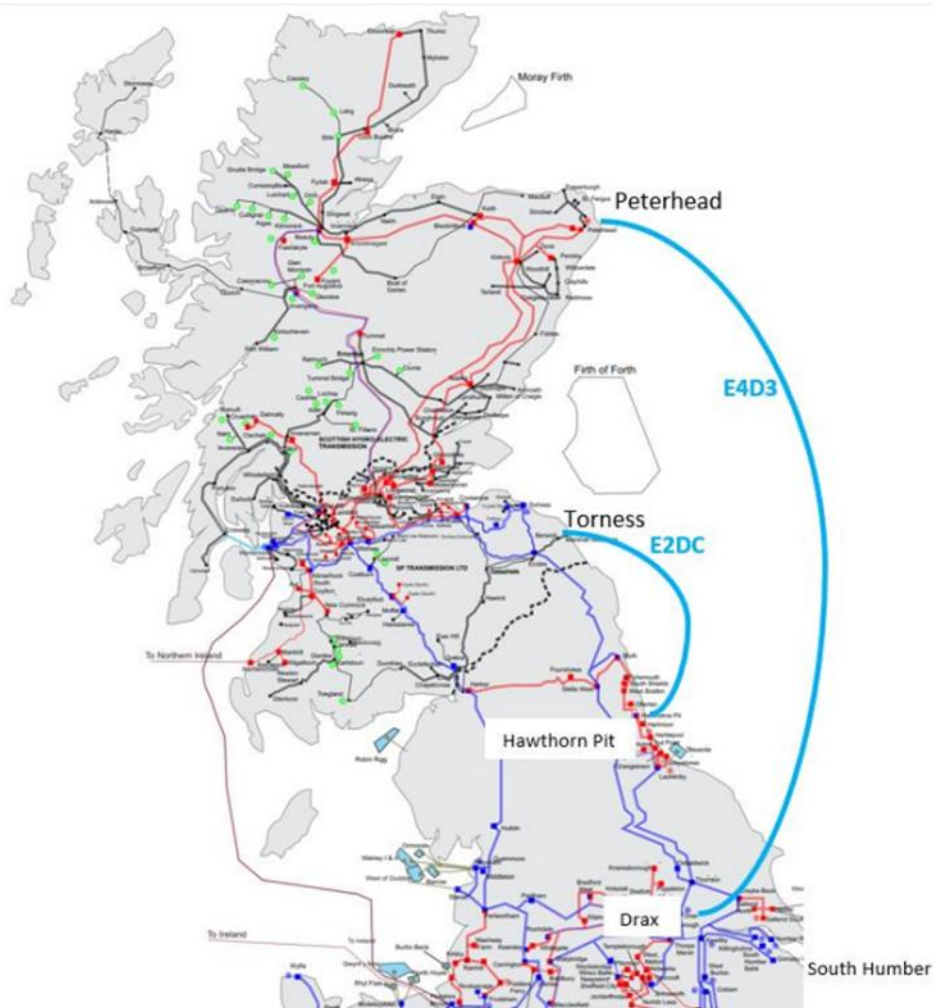
Figure 2 - The TOs' indication of preferred schemes for Eastern HVDC projects.

2.3. The two FNC submissions are supported by a single CBA carried out by the ESO, as well as recommendations from the annual NOA process and report 9 .