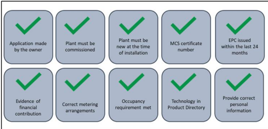
Figure 1: Eligibility criteria

Figure 1, below, gives an overview of some of these eligibility criteria.